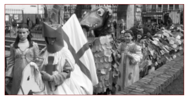
A Pictures taken at the launch of the Cork City libraries celebration of child summer events brochure which is full of events to celebrate childhood and spans from April to August. The Celtic drama depicted is The Only Jealousy of Eimear.