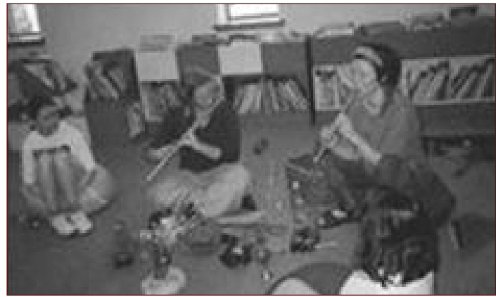
Creative Music Circle in action

The children learn songs from all over the world and get a chance to try out the many different instruments provided in the workshop.