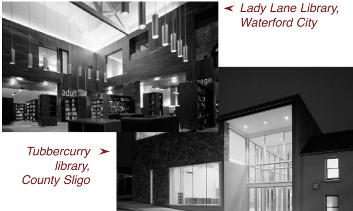
← Lady Lane Library, Waterford City

2007 Public Library Building Awards UK and Republic of Ireland: applications are now invited for the 2007 Public Library Building Awards UK and Republic of Ireland . The Awards recognise the best in library design and innovation and Irish libraries have frequently featured amongst the winners. Most recently, Waterford City Library won The Heart of the Community Award in 2005, while Tubbercurry, County Sligo, was highly commended.