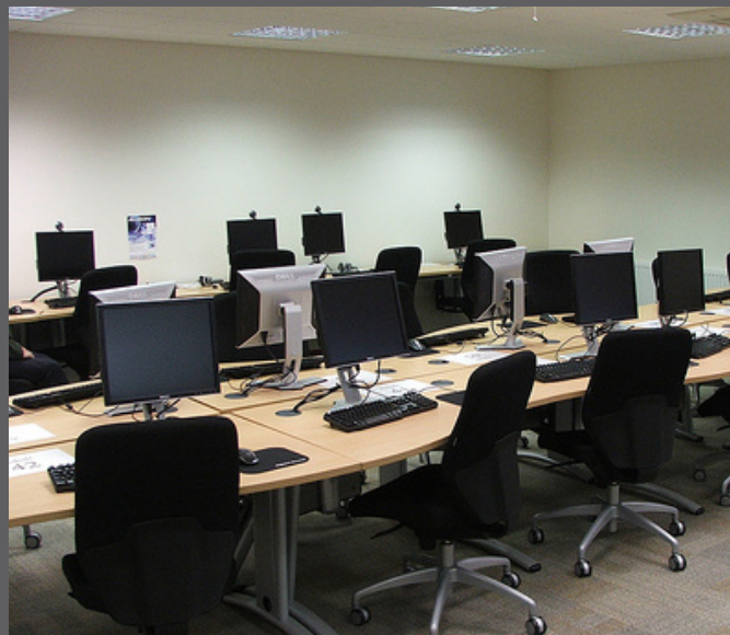
The interior of the Watch House Cross Community Library

Watch House Cross Branch Library, Moyross, Limerick, opened on May 31 2007, to a total catchment population of 15,500.