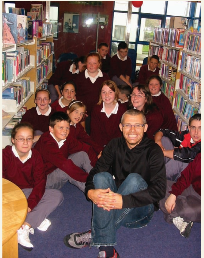
Fada figure, Des Bishop in Carraroe Library

During his time in Connemara, Des Bishop, or Deasún Mac an Easpaig as Gaeilge, became a regular user of the Carraroe Library. He participated in a number of library events, and the library supplied him with books and other materials in support of his research into the Irish language and culture. ILN