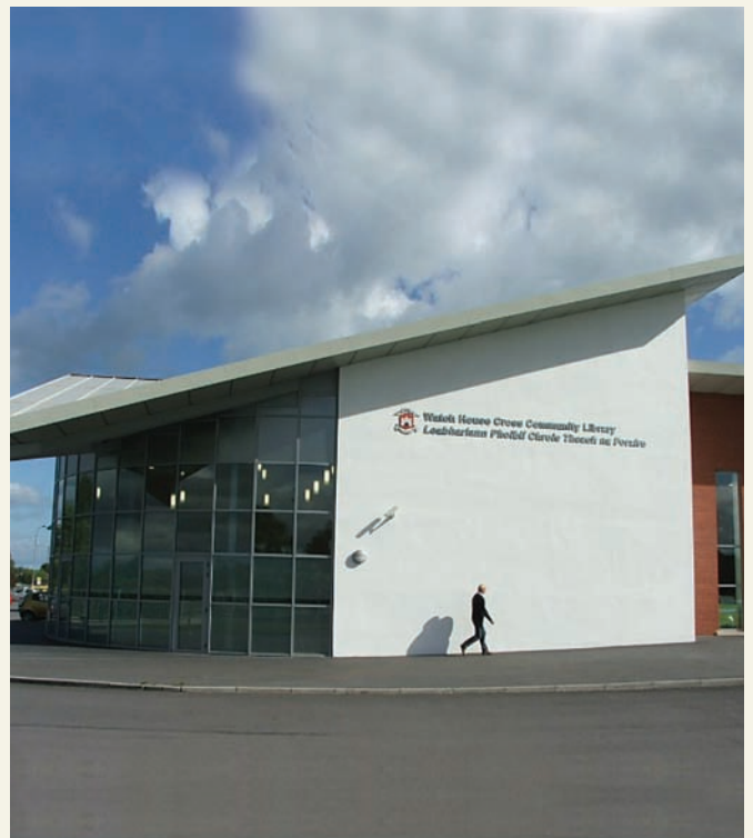
Outside the Watch House Cross Community Library

DELL has already provided the library with an earlier grant of US $20,000, which permitted the purchase of top of the range hardware and software packages for Watch House Cross Library. This recent DELL foundation grant is a most welcome contribution towards furthering the library's vital role in the regeneration of the north side of Limerick City. ILN