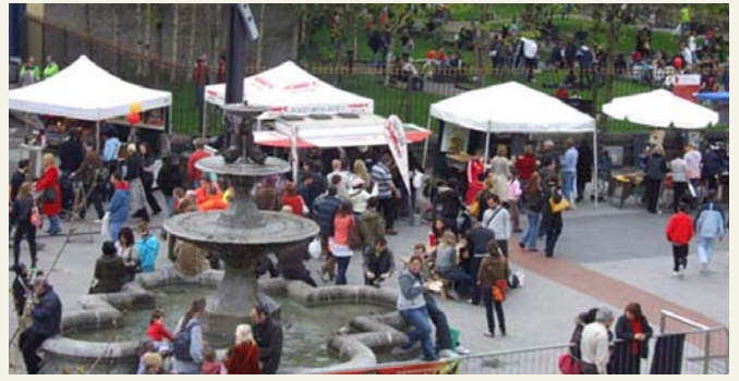
The World Book Day street fair