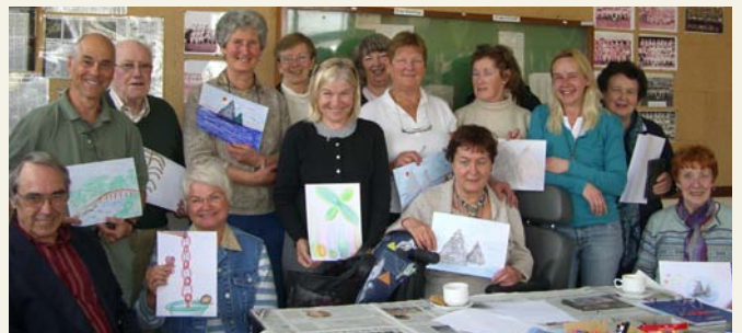
Participants at the Kerry Library art sessions