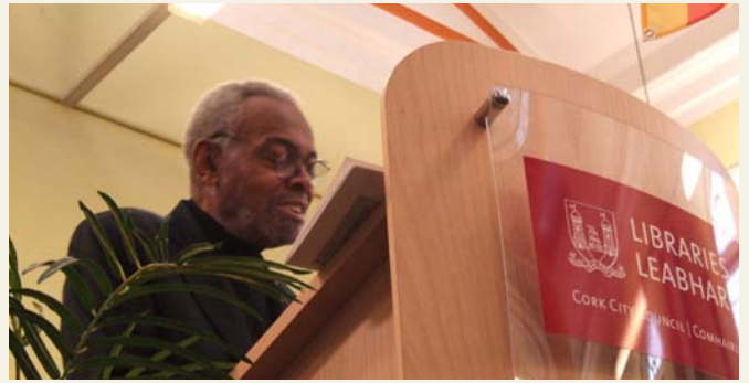
Amiri Baraka speaking at the Central Library