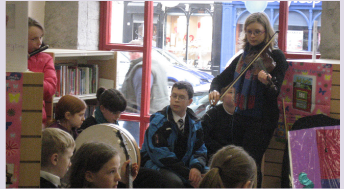
Children enjoying the musical recital at Midleton Library Open Day

There was much activity at the information stands provided by local services such as the Citizen's Information Board, Social Welfare, SECAD, Youghal Municipal Heritage and Youghal Fair-Trade committee.