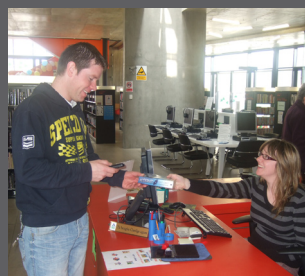
Borrower and staff member at Thurles Library

Tipperary Libraries was the first library authority in Ireland using the Horizon Library Management System to introduce notices by SMS text to customers to let them know that book requests are ready for collection. This facility is currently being rolled out to all notice types and is being piloted for event notifications such as bookclub meetings and author visits. SMS Texting has made the request process quicker and more customer friendly as well as being more cost effective.