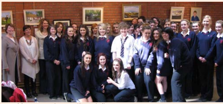
Transition Year students at Clonmel Library

Finally, in April the students came to the library to present their reactions to the novels. They presented book reviews, art work, poetry, sculptures and one group told the story of Once through music. All this work was displayed for a month. The class was very enthusiastic about the project and said how much they enjoyed it. They went so far as to ask if this would be done again in the school