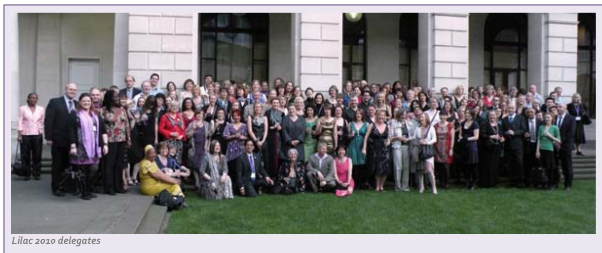
Lilac 2010 delegates

Hosted in 2010, for the first time outside of the UK, by the Shannon Consortium Library Network Support Services (LNSS) comprising of Limerick Institute of Technology, Institute of Technology Tralee, Mary Immaculate College and the University of Limerick, Limerick city has recently received the great