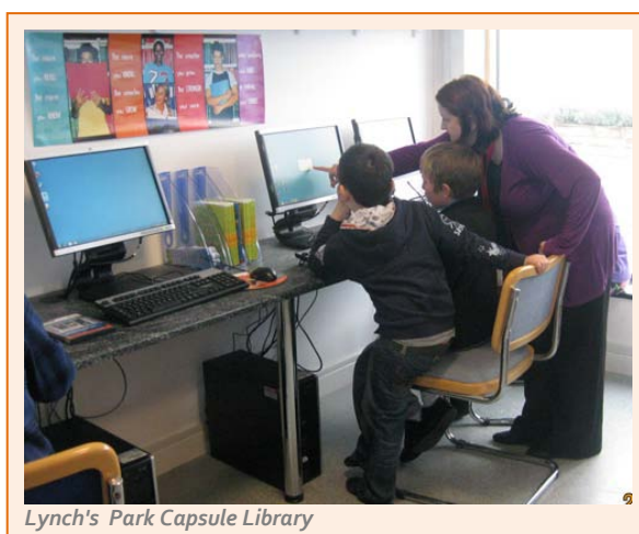
Lynch's Park Capsule Library

A capsule library for Traveller families opened at Lynch's Park Community Centre in Clondalkin, in January 2011. This project (developed as part of the