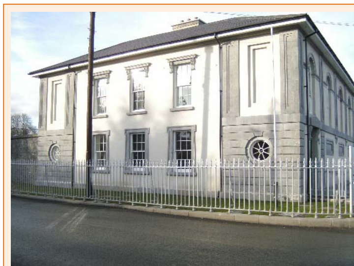
Stradbally Library and Arthouse, Co. Laois

Housed in Stradbally Courthouse, the Library and Arthouse was originally built as a petty sessions' court in 1830. It became the property of the Irish Free State in 1922 and the first sitting of Stradbally District Court was held in the building in 1924. The last case was held in the courthouse in March 1961; thereafter it was used by Laois County Council as a branch library, council office and machinery yard.