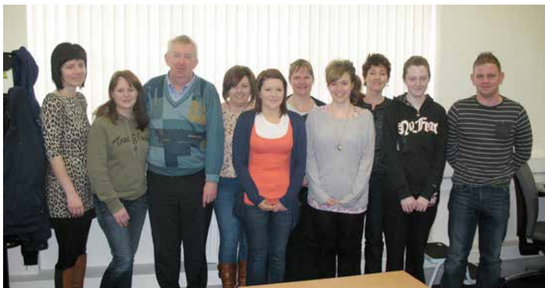
FOCUS GROUP WITH ADULT LEARNERS IN COUNTY DONEGAL

Most people were unaware of all the services library offered; [There is] a need to get better at marketing library services in order to make people who don't use the services aware of them; Need to promote and use social media (Facebook and Twitter) more; Need to change the image/perception of public library services, for example some adult learners mentioned they were unwilling to 'admit' [...] they were a library member.