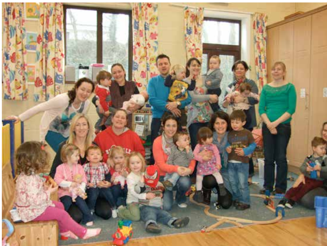
FOCUS GROUP WITH PARENTS OF YOUNG CHILDREN IN LIMERICK CITY