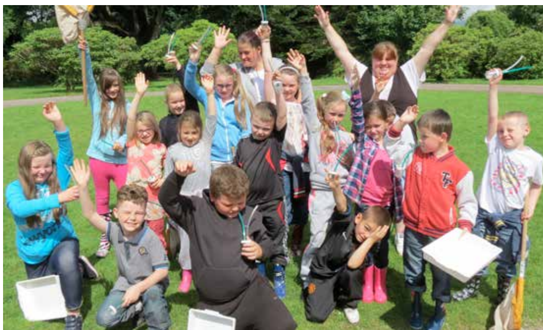
FOCUS GROUP WITH MEMBERS OF THE WEST END YOUTH CENTRE, LIMERICK CITY