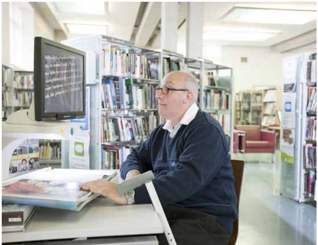
JOHNSTON CENTRAL LIBRARY, CAVAN COUNTY COUNCIL

One novel by an award winning author is chosen as the focus for the festival. People in the local communities read the novel and explore the themes and writing styles through lectures and workshops. The festival ends on a high note with a county tour by the chosen author. Readers enjoy an informed and interactive exchange with the author. This festival is very popular and attracts new readers.