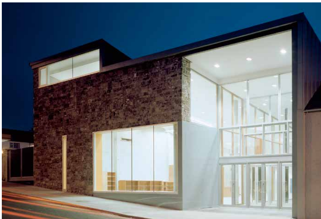
TUBBERCURRY LIBRARY, SLIGO COUNTY COUNCIL

An Chomhairle Leabharlanna was dissolved on 31st October 2012 and its functions were transferred to Libraries Development, a new division of the LGMA.