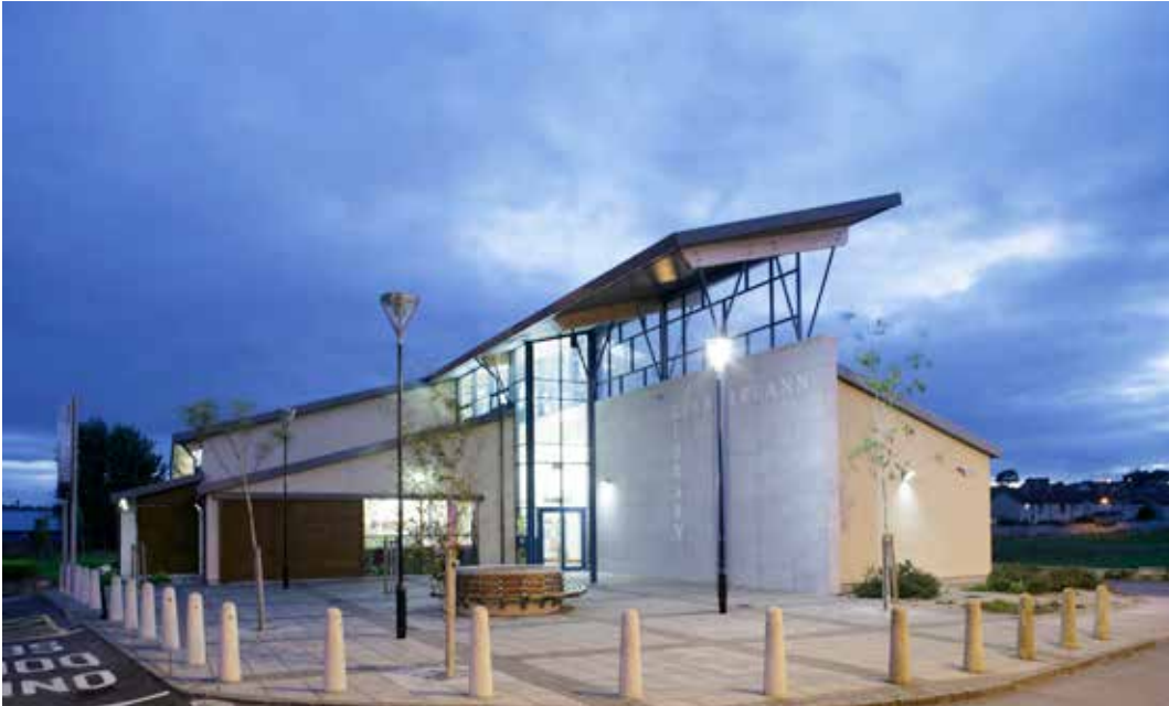
WESTSIDE LIBRARY, GALWAY CITY COUNCIL

Branching Out: A New Public Library Service (1998) put forward a series of recommendations aimed at developing a public library service for the 21st century, including: the provision of democratic access to information, support for lifelong learning and community based support for literacy training and reading. The strategy was devised on the basis of maximising the potential for public libraries to make major contributions to government objectives, particularly in the areas of the information and knowledge society and social and economic inclusion.