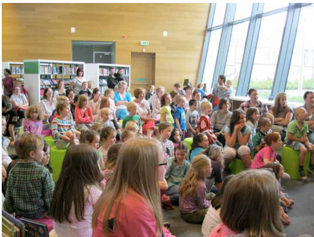
SUMMER READING CHALLENGE PROGRAMME AT GOREY LIBRARY, WEXFORD COUNTY COUNCIL

The modern public library is a vibrant, busy, colourful, attractive place where families can enjoy a range of activities and events. The library promotes intergenerational interaction in a safe, democratic community facility which supports social cohesion and inclusion.