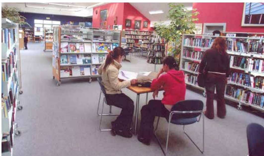
LISTOWEL LIBRARY, KERRY COUNTY COUNCIL