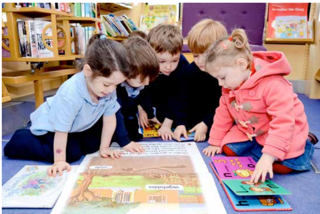
MOBILE LIBRARY, ROSCOMMON COUNTY COUNCIL

The latest project under the EU Leonardo Programme focuses on vocational training of library staff. In partnership with Bulgaria, Slovenia, Romania, Austria, Finland and Serbia, Monaghan County Library Services have been granted €18,000 to develop a model for the education of library staff to work with job seekers and the long term unemployed. The project teams will work on the development of a programme of workshops and lectures for staff which will culminate in a conference to present their findings. The project will produce a curriculum and handbook for the training course, which can be distributed to other library service and educational institutions.