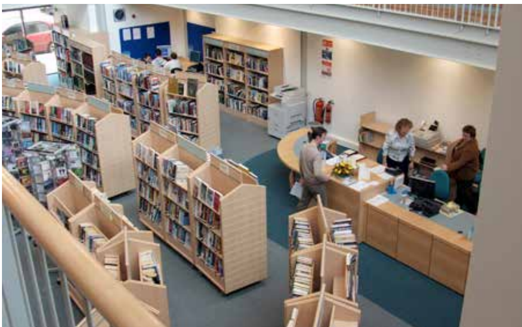
BALLINAMORE LIBRARY, LEITRIM COUNTY COUNCIL

The library has a responsibility to collect and make available local community and cultural information to ensure that content rarely collated elsewhere can be accessed in the public library.