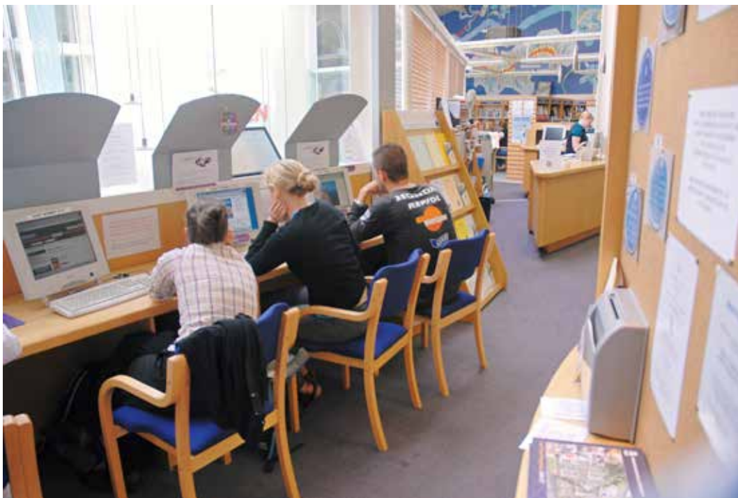
ARDKEEN LIBRARY, WATERFORD CITY COUNCIL

Kilkenny Library Service partners Kilkenny VEC in the provision of computer classes at Ferrybank Library in South Kilkenny. This initiative which commenced in February 2013 is funded by Kilkenny VEC Community Education Service which also supplies the tutor. The venue, PCs and promotion are provided by the library. The classes cover basic IT skills and take place for two hours per week for six weeks.