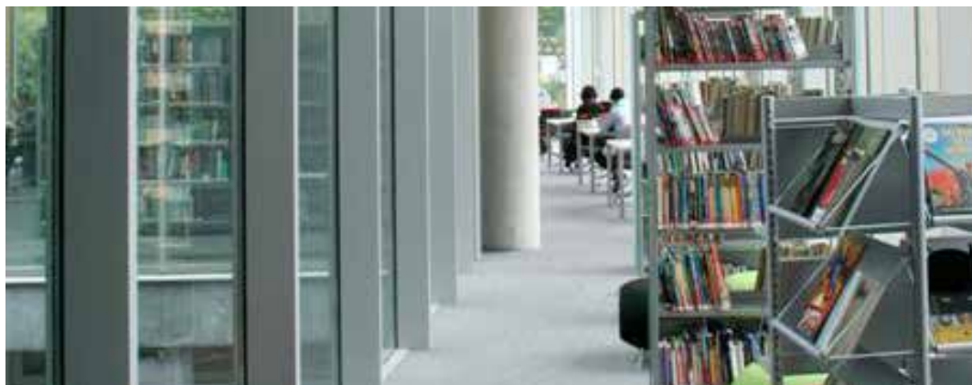
MULLINGAR LIBRARY, WESTMEATH COUNTY COUNCIL

In health matters people want to know more, to feel in charge of their well-being, understanding conditions and being informed about treatments and medications. The library works as a resource and a source of support. The development of books on prescription and the value of targeted reading materials has become an increasingly valued aspect of library provision.