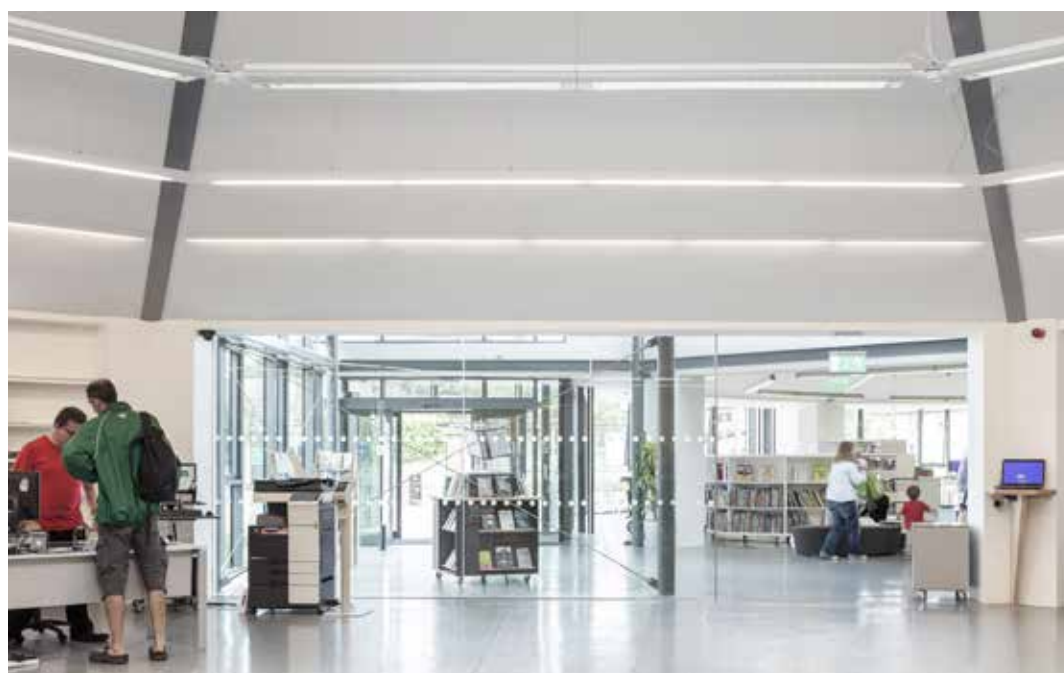
DEANSGRANGE LIBRARY, DUN LAOGHAIRE-RATHDOWN, COUNTY COUNCIL

It was evident that a national policy underpinned by increased staffing and a capital funding programme was required to deliver a good and consistent standard of public library service in all 32 library authorities. In 1998, the Department published the first strategy for public libraries, a costed and stakeholder agreed plan for a modern service.