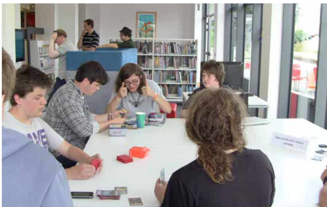
TEENAGE BOARD GAMES AT TULLAMORE LIBRARY, OFFALY COUNTY COUNCIL

For the last two years, clients of RehabCare Bray have been visiting Ballywaltrim Library on a monthly basis to participate in their own book club facilitated by library staff. With the RehabCare centre located in an area mainly occupied by businesses, staff were finding it difficult to introduce their clients to the greater community. Through stronger links with their local library, various coordinators have commented on how much more enthusiastic their service users are about putting themselves in front of their peers to voice their opinions and share experiences. Library staff have also become more aware of the various challenges faced by users of these services which has, in turn, helped them in approaching their work when it involves special needs groups.