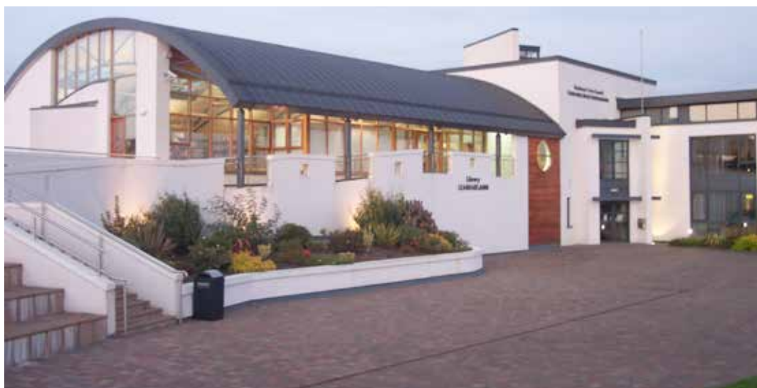
BUNDORAN LIBRARY, DONEGAL COUNTY COUNCIL

Public Libraries are champions of Irish language and culture. In line with the 20 Year Strategy for the Irish Language 2010-2030 25 , libraries work with Irish language agencies and educational bodies towards creating online language learning resources to support increased emphasis on oral and aural skills in the curriculum. As in other EU countries, eBooks through the national language are generally made available through the public library network, encouraging and facilitating learning and enjoyment of the national language.