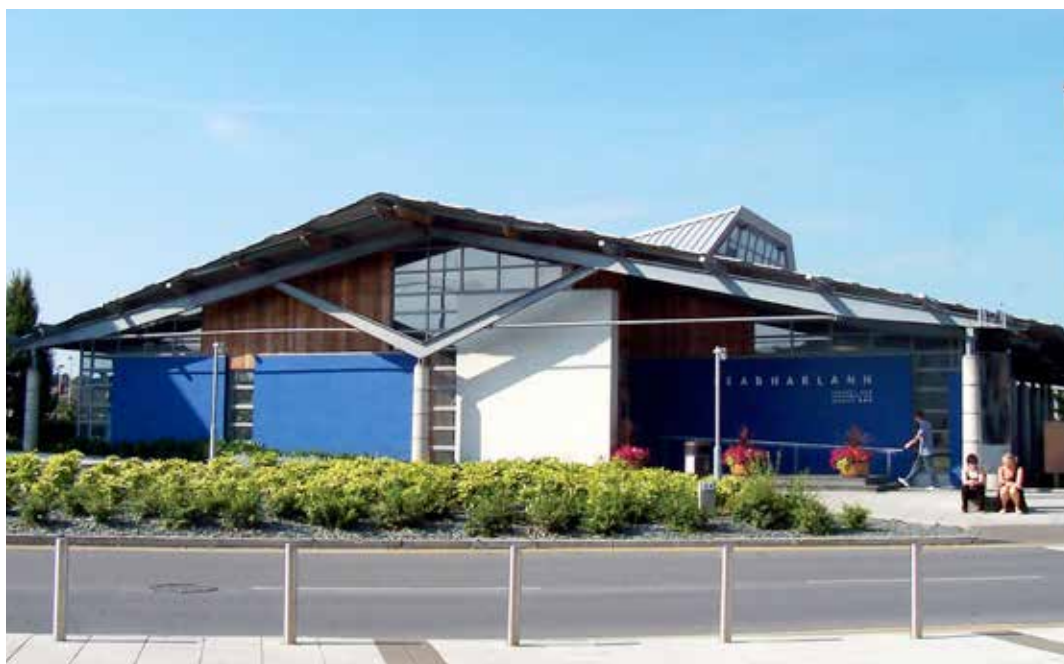
DOORADOYLE LIBRARY, LIMERICK COUNTY COUNCIL

The Branching Out strategies established a forum for all stakeholders to collaborate on forming a positive, inclusive vision for public libraries and led to a well thought-out and grounded national policy that transformed services, buildings and resources. As the progress made in the two previous strategies has been substantial, it is important to build on the momentum of results and outcomes already achieved. In light of a very different economic climate and the changing face of local government, a new strategy is required to meet new challenges and opportunities.