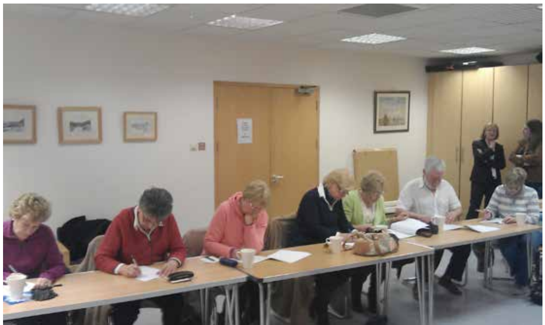
FOCUS GROUP WITH OLDER PEOPLE IN SOUTH DUBLIN