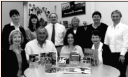
Staff members of Sligo County Library, winners of last year's 1st prize of €1,500 Go-Anywhere Holiday Voucher in the MS READATHON Librarians' competition.

Start of MS READATHON 2003 – entries to be returned by 28th November. Full details available from the Multiple Sclerosis Society of Ireland, Dartmouth House, Grand Parade, Dublin 6 or www.ms-society.ie