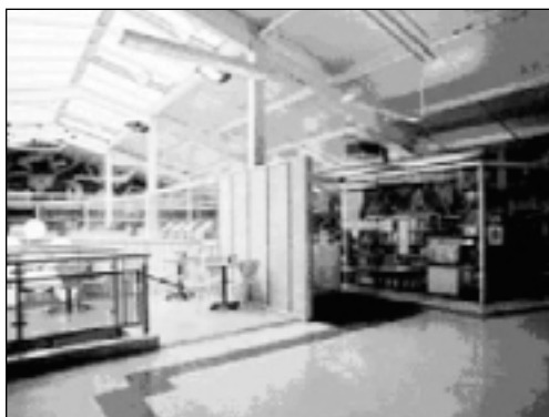
▲ Ardkeen Library

"Our judges were impressed with the overall ambience of Ardkeen Library, where space, light and attractive furniture have been used to maximum effect," said Mr Knight of the small conversion winner.