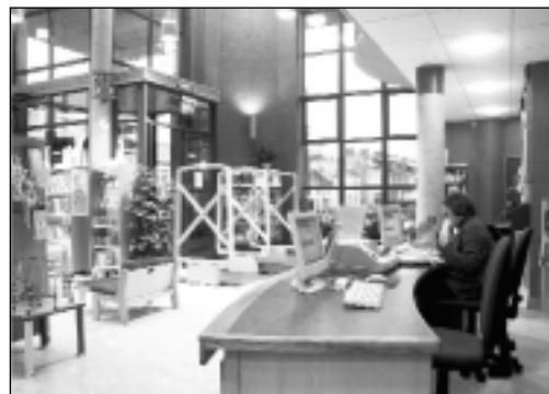
Cootehill Library ▲

"Small but perfectly formed" was the verdict on Cootehill Library, County Cavan, winner of the best small new building category. Huge windows and a glass dome gave the library a light airy feel, and the white shelving and pale wooden chairs added to the sense of space. Lots of attention to facilities for disabled people and effective integration of ICT helped make this library a winner.