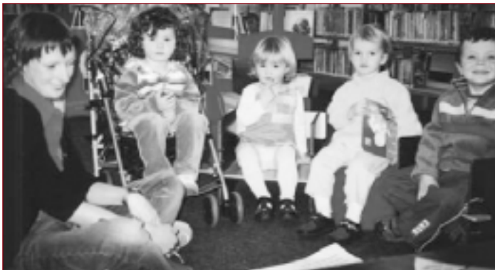
▲ Toddlers "I Love Books" storytime in Tralee Library