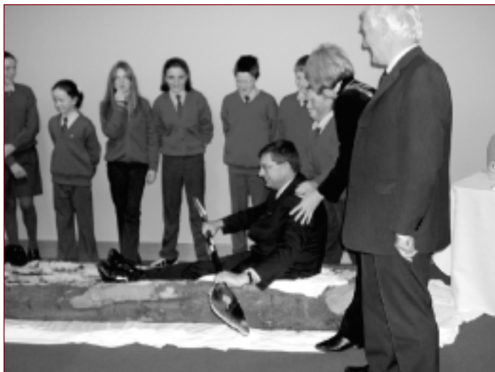
▲ Steady as he goes! Minister Ó Cuív getting some hands on experience of exhibits at the opening in November of Galway Science Week in the Library.

Kerry County Libraries hosted an exhibition on library buildings in Ireland financed by Andrew Carnegie.