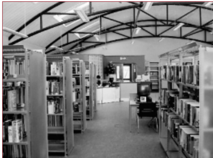
▲ Bundoran Library

Bundoran Community Library opened to the public on Tuesday 4th November 2003. The library is part of Bundoran Civic Centre which also houses Bundoran Town Council, and is located alongside the local health centre and a six screen cinema. The library is open from Tuesday to Friday at present and the opening hours will be extended following the official opening which will be early in 2004. All schools in the area have been contacted to inform them of the opening of the library and of the services that it provides. The Donegal Democrat carried a large spread on the library and the assistant librarian in charge was interviewed on North West Radio. As a result of this feedback has been positive and an average of 250 people have joined the library each week since it opened. The population of Bundoran is ca. 2,500.