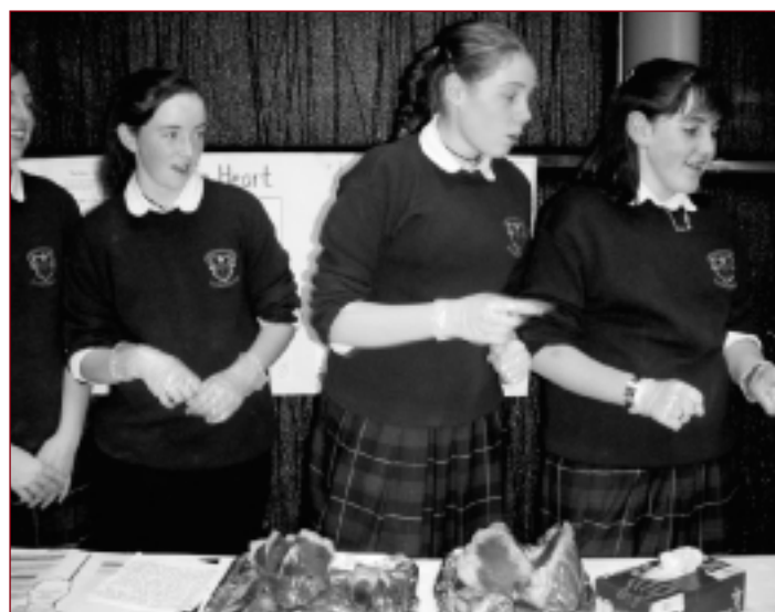
▲ Students with their science exhibits at the opening of Galway Science Week in the library.

Students from primary schools around Galway gathered in the Galway-Mayo Institute of Technology library for the opening of Galway Science and Technology Week by the Minister for Community, Rural and Gaeltacht Affairs, Mr. Éamon Ó Cuív, T.D. Students brought their science projects with them and explained the ideas behind the projects. The projects ranged from the workings of the human heart, using cow and sheep hearts to demonstrate how it works, to an examination of natural habitats of the Ballindooly area of County Galway. Also present was the Big Bug Show, giving students an opportunity to handle amazing invertebrates literally at first hand.