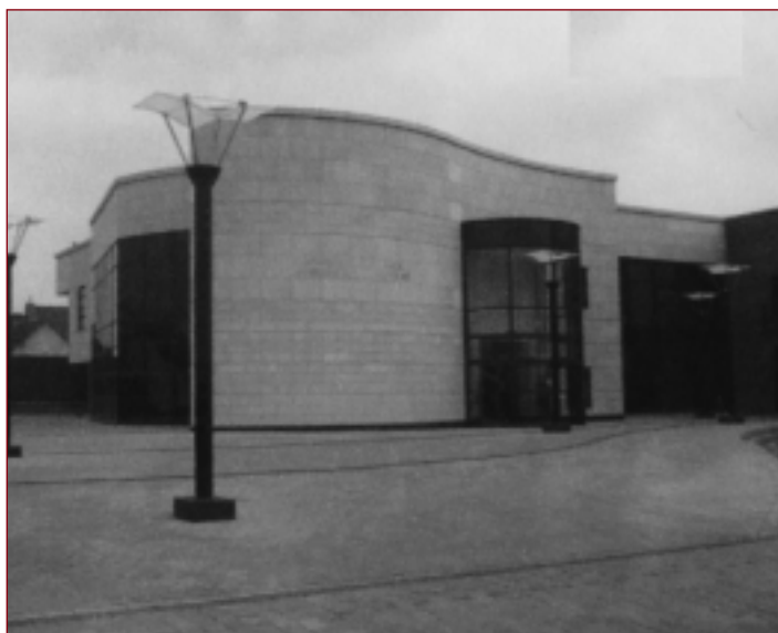
▲ Ashbourne's one-stop shop and library.

I mentioned earlier my previous existence as Minister for the Environment, Heritage and Local Government and now, in my current existence as Minister for Education and Science, I cannot over-emphasise the importance of libraries in education and opening possibilities to people of all ages. The public library continues to be one of the most popular of public services according to a recent market survey of library users and non-users. 1 Over two thirds of the country's adults are members of a