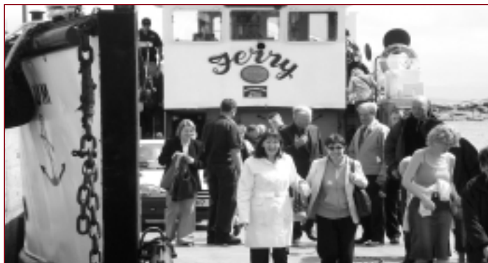
▲ Library staff arriving on Arranmore.

Taobh Tíre: a better library service for rural areas, is a pilot project under the Public Library Research Scheme which is financed by the Department of the Environment, Heritage and Local Government and supported by An Chomhairle Leabharlanna.