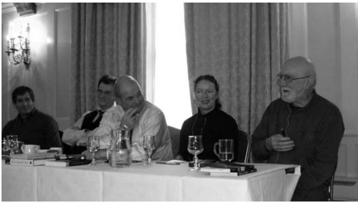
Critical Mass – the Sunday Symposium