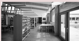
3. Tory Top Road, Cork City