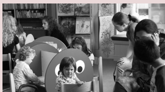
1. Johnston Central Library, Cavan