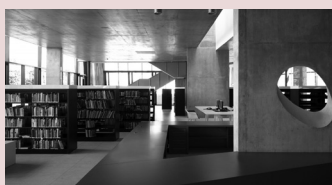
4. The Source Library & Arts Centre, Thurles