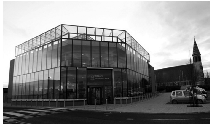
Bishopstown Library, Cork City