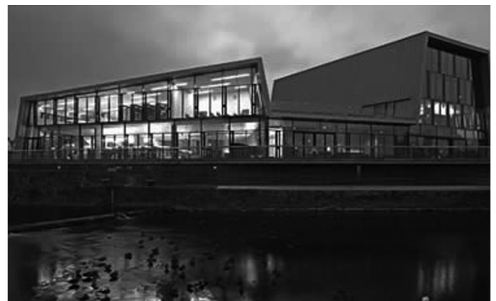
The Source Library & Arts Centre, Thurles