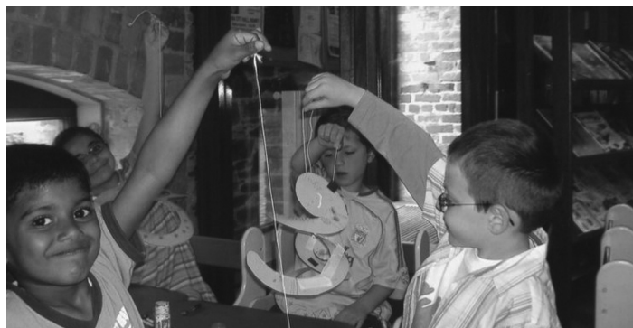
The Big Wild Read

The challenge offers incentives and rewards to participating children who visit their local library over the summer. Upon completion of the challenge, the children will be presented with certificates to mark their achievement. It is hoped that the children will read a wider variety of material, will share their reading with others, discuss the books read and that their reading confidence and creativity will grow as a result of taking part in the challenge.