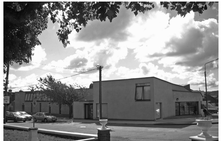
Tory Top Road Library, Cork City