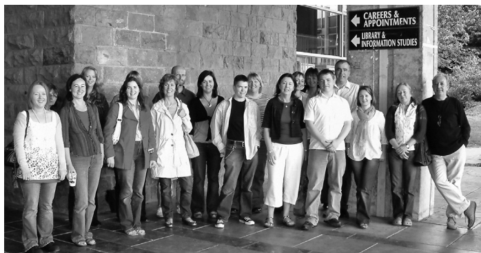
Distance learning students queuing patiently for a piece of the cake...