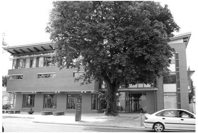
Johnston Central Library, Cavan