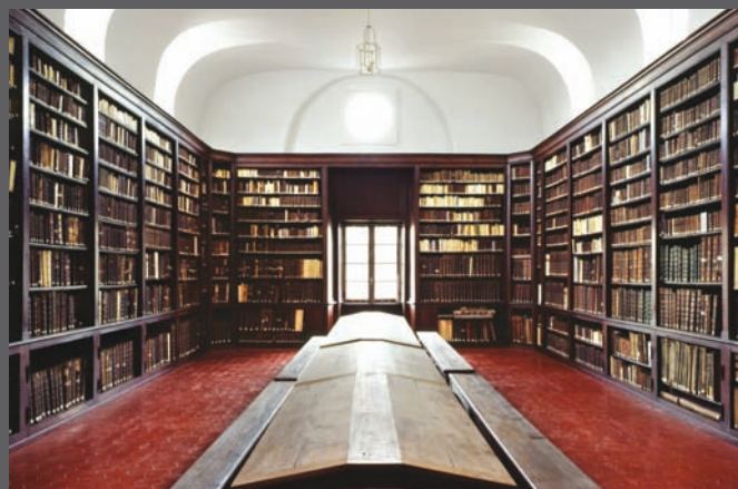
The Old Library, Centre Culturel Irlandais, Paris

The original library collection was lost during the French Revolution. The current holding of 8,000 items, of which almost half date from the 15th to the 18th centuries, consists of books and manuscripts from suppressed religious establishments, including Scottish and English, which were presented to the Collège by Napoleon when it was re-opened by consular decree in 1805. Works of Irish interest were added during the following centuries, creating a library of books on theology, history, geography, philosophy and music. The Library was entirely restored at the same time as the Centre Culturel but only now has the work of conservation of this unique collection reached completion. Books have been cleaned and repaired and leather bindings, with their gilded lettering, restored to their original beauty. An on-line catalogue provides detailed information for the scholars and