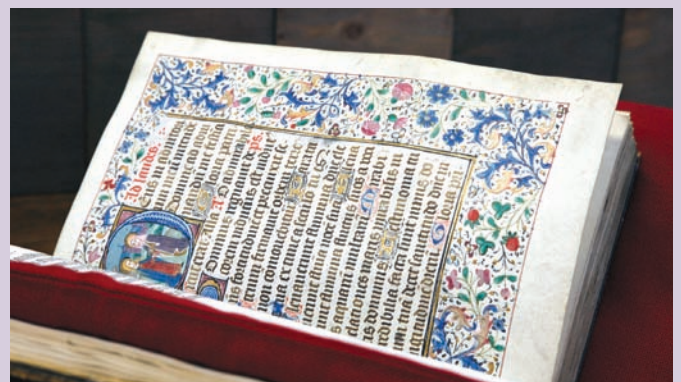
The Book of Hours of Notre Dame