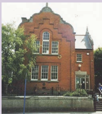
Malahide library prior to renovation

Malahide Library re-opened on December 19 2007. The existing Carnegie library, built in 1911, has been renovated and extended to include an extension at the rear of the building which covers three floors. The total available space of the new, state-of-the-art library is now 1,177 sq. metres.