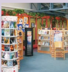
The library of St. Paul's Community College, Waterford

The Government has allocated over €5 million in funding from the Dormant Accounts Fund and RAPID Leverage Fund for 147 projects to enhance school library facilities at schools participating in the DEIS programme (Delivering Equality of Opportunity in Schools), schools in or serving RAPID areas and Special Schools in disadvantaged areas.