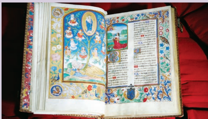
A Flemish Psalter