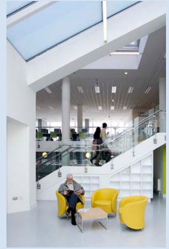
The new South Dublin Library in Tallaght

credit to their library membership cards in order to make payment for printing and photocopying more convenient. A conference suite on the lower ground floor has video conferencing facilities and will offer an extensive range of cultural and educational events for local people.