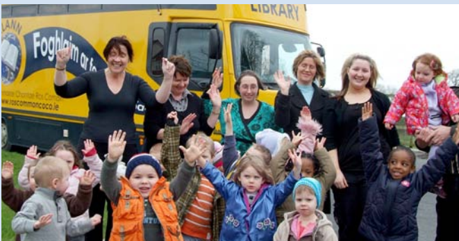
Pre-school children at the mobile library service

In a county like Roscommon, with a large percentage of people living in rural areas, the service has been a welcome and positive development.