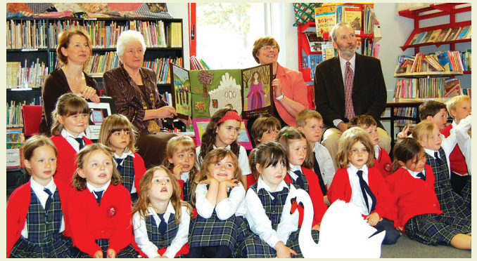
At the launch

She then took the images and created a textile book, which contains elements of those images, recreated in stitch. The textile book is very tactile, and is intended as a hands-on piece of art for the children's library. It contains a number of pieces which children can interact with, and is housed, when not in use, on a swan-shaped pedestal. ILN