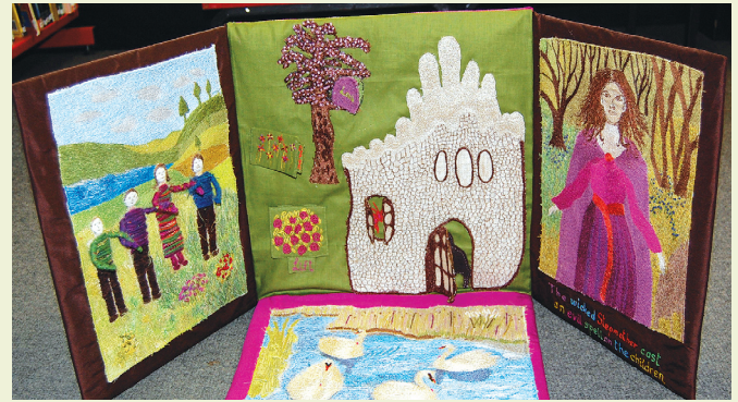
The commissioned textile piece