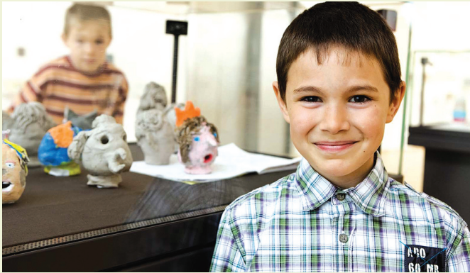
Tell Your Story Project

The project ended on Saturday May 10 with a Family Day and an exhibition of some of the children's