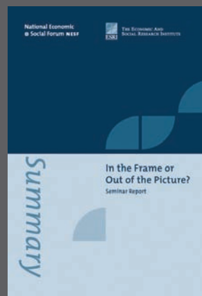
NESF Summary Report

Copies of the seminar report are available from the NESF (16 Parnell Square, Dublin 1) or the Government Sales Office (Sun Alliance House, Molesworth Street, Dublin 1) priced €3.00. ILN