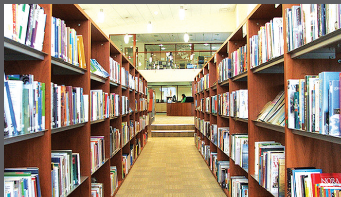
Watch House Cross Library, Limerick City

Frontline is structured in 7 modules. Modules 1-4 can be taken as a coherent short course for those who cannot be released to do