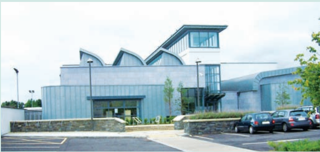
Castleisland Library and Area Services Centre