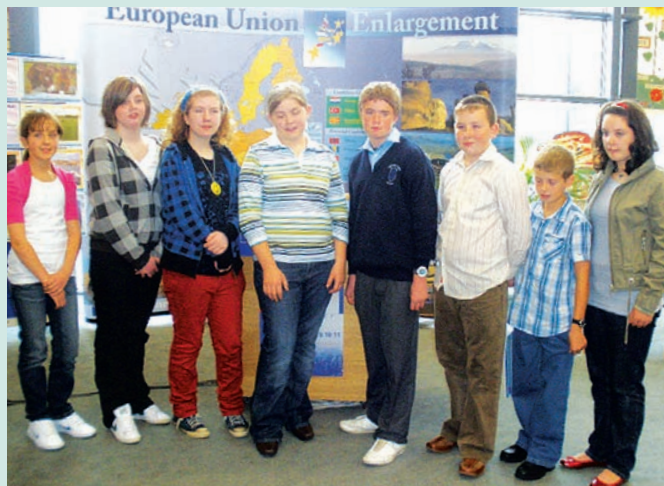
2009 Europe Direct winning photographers

For more information see www.europedirect.ie