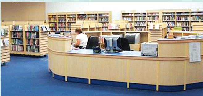
Castleisland Library Interior

Kerry County Council's newest public library at Castleisland opened on Wednesday, August 27 2008 and has been very well received and used by the public since then.