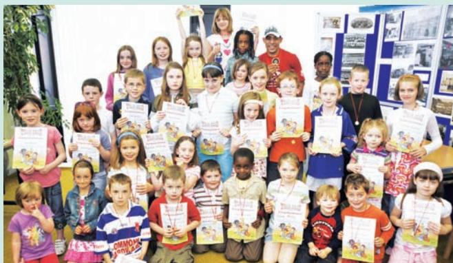
Darren Sutherland and Team-Read members in Navan Library

It was a dream come true for the young children who participated in the Olympic themed reading programme to receive their medals from a real Olympic hero.