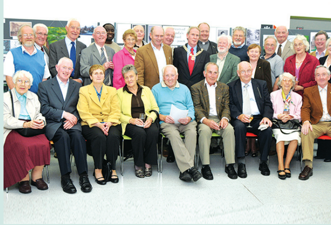
Participants at the launch of South Dublin Libraries' Oral History Collection

October. Highlights included the launch of the second edition and audio book version of If Those Trees Could Speak: The Story of an Ascendancy Family in Ireland . The audio book and e-book versions are among the many local studies resources which are available to download free of charge from the Download Zone at www.southdublinlibraries.ie .