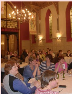
The "Giant Book Club Gathering" on the festival opening night. Author John Connolly was on hand as book clubs from all around the country discussed his Book of Lost Things .

The number of events, and the number of visitors, was up on last year and feedback has once again been extremely positive.