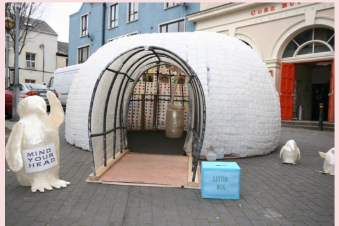
Finished Igloo, and friendly penguin

The artists also introduced children and staff to the technique of celotape wrapping, creating penguins, utensils and Crean himself from rolls of celotape. The igloo began life in the basement of St Mary's Road Library and was completed in a public space outside the library which proved to be a traffic stopping sight. The project brought the reading experience to life for those involved and created an excitement around reading and the library. The Igloo is currently on display in St Mary's Road Library and will visit other libraries in the City Libraries network later this year. ILN