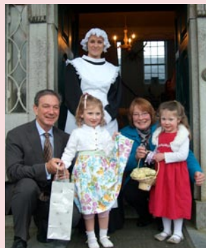
SiarScéal Festival Launch, Strokestown Park House