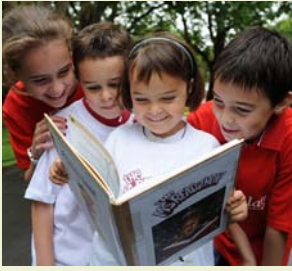
At the Readathon

The sign up period for MS READaTHON 2009 starts this month, with the reading period running from the 16th October until the 16th November.