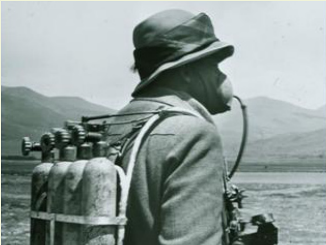
From TCD MS 10805