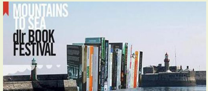
At the Readathon

Further information is available on www.mountaintosea.ie