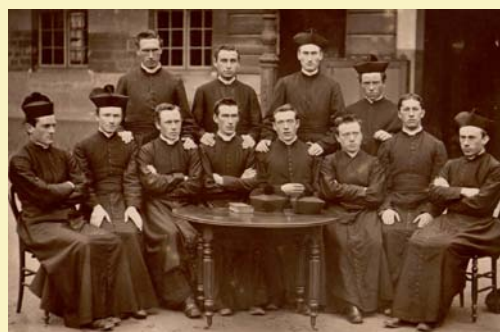
Group photograph in the courtyard of the college, 1876-1877

The Irish College has digitized part of its historical archives, in order to relate the history of the building and its residents. The archives include documents on parchment, registers of students, letters concerning ordinations, plans of the building, photographs, letters and many other documents. More than 23,500 images are now available for free on-line consultation. Visit: http://archives.centreculturelirlandais.com