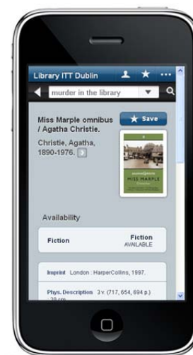
View of a record

The library's web site automatically detects when it is being accessed using a mobile device and offers the user the option to utilize the mobilized version. This version allows the user to: