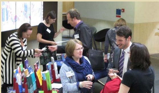
DREaMI delegates chat beside the publishers' stands