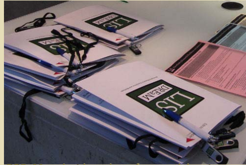
DREaMI project launch conference delegate folders, pens and data sticks