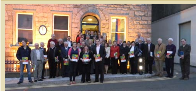
Groups outside Monaghan County Museum on launch night 13th April

The groups carried out extensive research on topics such as WWI; archaeological survey of an area, landed estates, big houses, geology, noted persons from the county and the history of townlands. Almost 100 hours of oral histories were recorded of the older generation living in the county and approximately 1,000 photographs were collected and digitized. The participants took part in courses on genealogy, archaeology, digital photography, oral history recording, creative writing and research techniques. A series of visits by authors, storytelling