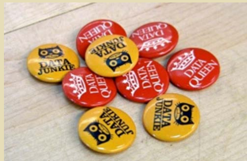
Badges for the data geeks and data queens at the DREaM launch conference