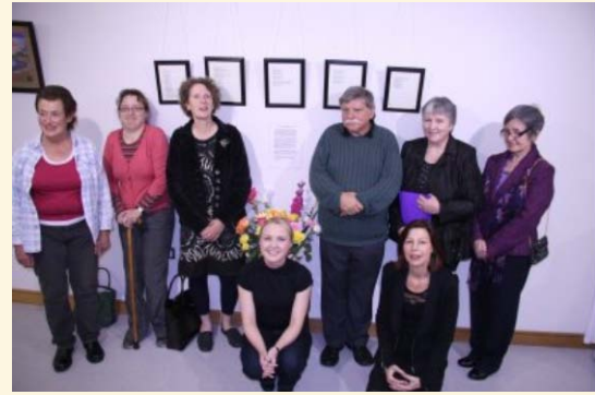
Members of Scariff Poetry Group at the opening of their exhibition